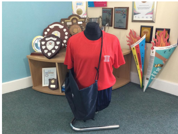
1 - Please remember that children are required to wear a plain coloured T-Shirt for PE in their Tower Team colour.