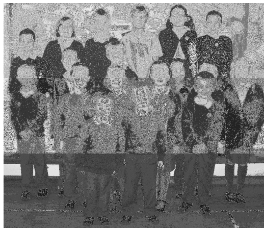
Our school council representatives